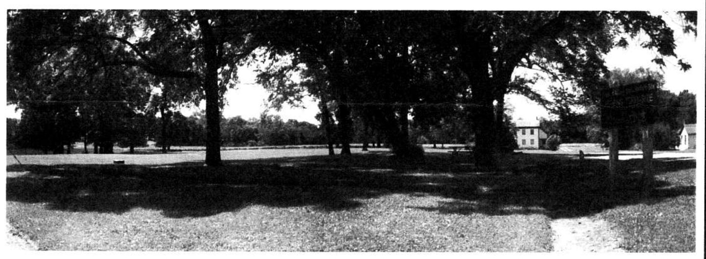
Battle of Athens Missouri State Historic Site

This Battlefield located in Northeast Missouri is well preserved with many original structures. It's the site of the most Northern Battle west of the Mississippi. Each year they host a reenactment on the actual battlefield and this year it is on August 6th and 7th. It's a secluded place, probably does not get many visitors. Go see it sometime!